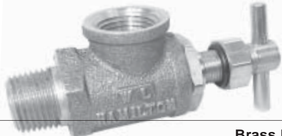
Brass By-Pass and Pressure Relief Valves