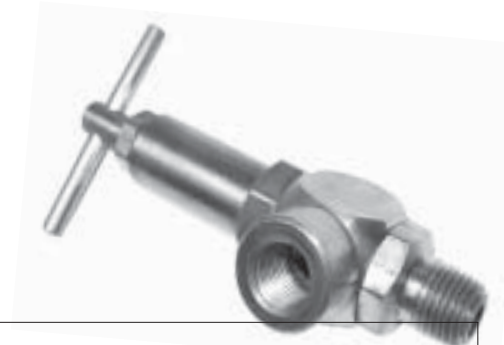
Brass By-Pass and Pressure Relief Valves